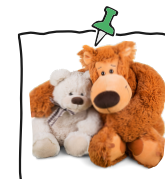
Looking After Each Other