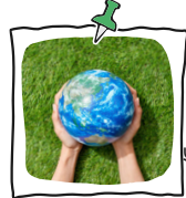
Caring for the Planet