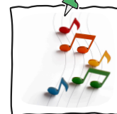
Come Dance With Me