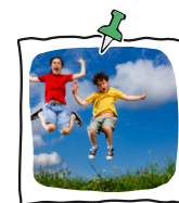
Run, Jump, Throw/Compete