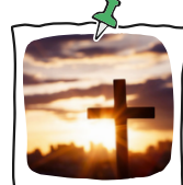
The Easter Story