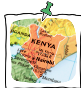
Comparing our local area with Kenya