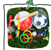
Outdoor Challenge/ Battering and Fielding