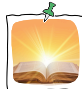
Stories and Messages