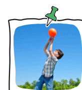
Run, Jump, Throw Throw and Catch