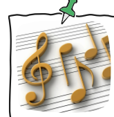
The King is in the Castle