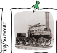
Local History - George Stephenson