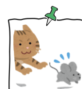
Cat and Mouse