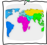
Continents and Oceans