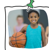
Yoga/Games and Strategy