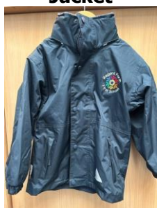
Reversible Waterproof Jacket